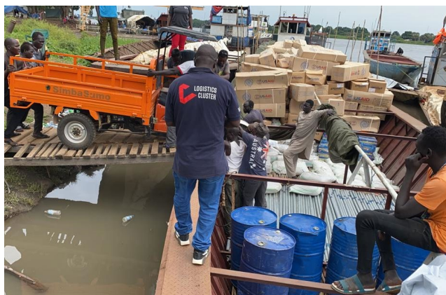
Loading of the first boat convoy from Juba to Bor, October 2020