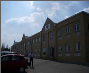
AIPACS SOUTH AFRICA