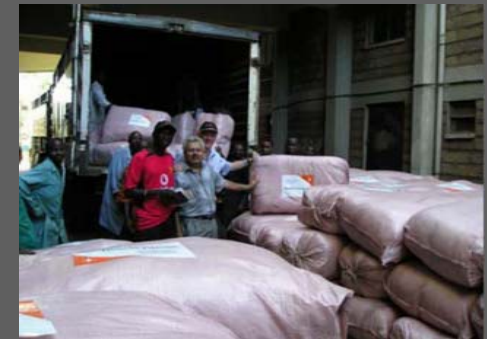
Mosquito Nets being loaded in Kenya for Nyala, Darfur.