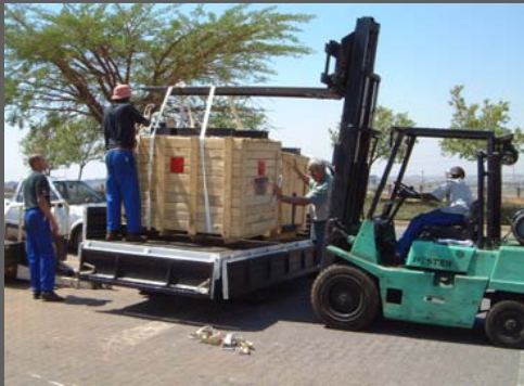
Generating Sets being loaded in South Africa for Abeche, Chad

AIPACS OAC is providing Procurement & Logistics support to various NGO's and Red Cross Organizations operating in the Darfur region of Sudan and Chad. Co-ordinated through AIPACS OAC regional office in Nairobi, Kenya and in conjunction with our partners at Astral Aviation, AIPACS has supplied: Tents, Plastic Sheeting, Mosquito Nets, Kerosene Cooking Stoves, Water Carriers, Generating Sets, Food & Hygiene goods to projects in Nyala, El Fasher and Abeche.