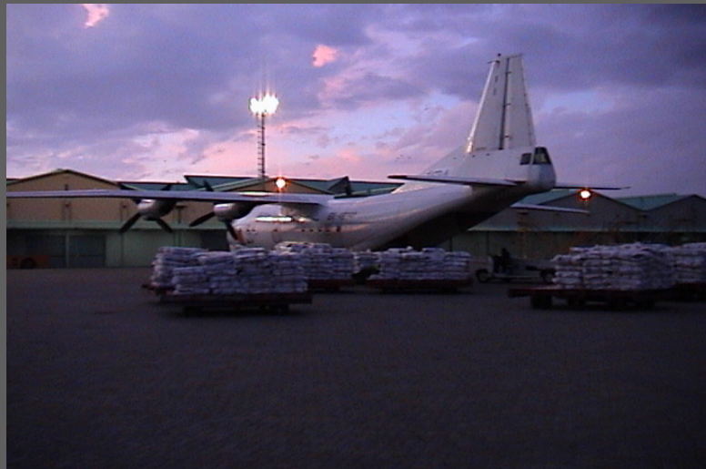
AIPACS ASTRAL AVIATION AN-12 Loading at Jomo Kenyatta airport, Nairobi, Kenya, with emergency relief supplies for Darfur.

LOCAL PURCHASING: 80% of the goods we are currently supplying to these projects are being purchased locally in Kenya, Tanzania, Sudan and South Africa