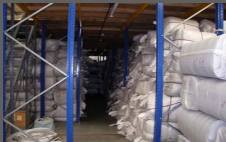
Blankets destined for El Fasher, Darfur

LOCAL PURCHASING: 80% of the goods we are currently supplying to these projects are being purchased locally in Kenya, Tanzania, Sudan and South Africa