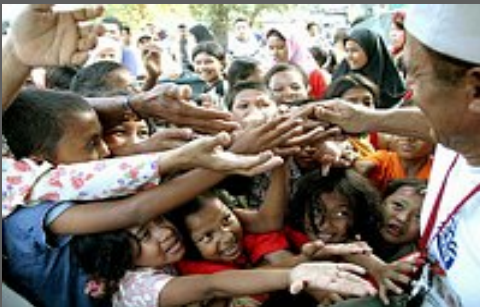
Even the distribution of sweets to local children in Sri Lanka was a major event!