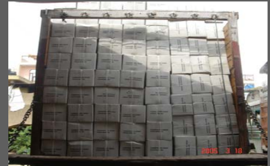
Family Kitchen Sets just loaded onto trucks from our warehouse in Delhi, India, en-route to the airport for airlift to Colombo