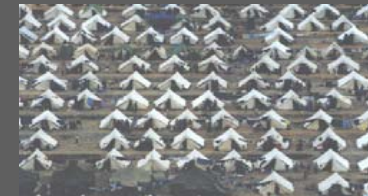
PROJECT - ANGOLA