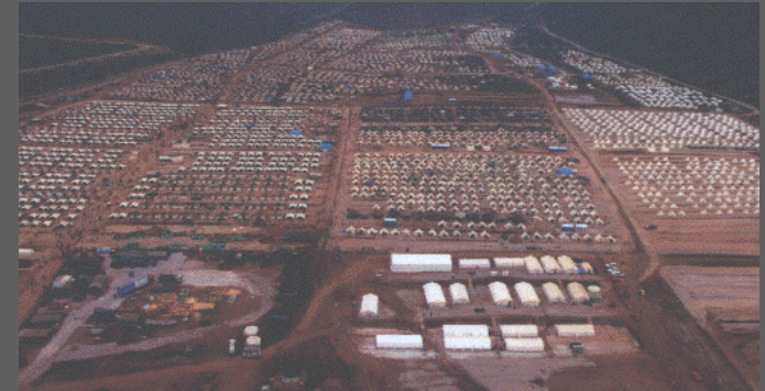
REFUGEE CAMP – FOR KOSOVO REFUGEES

MANAGEMENT & LIFE SUPPORT: Daily management and full life support, consumables and services on an ongoing basis.