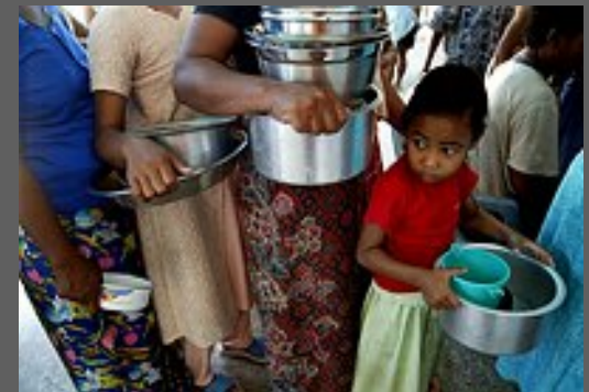
Kitchen Sets being distributed to families in the Andoman & Nicobar Islands

With the livelihoods of so many people ruined AIPACS OAC today continues to supply goods and services to help re-build the lives of the coastal communities in Sri Lanka and Indonesia