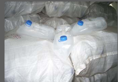
Collapsible Water Carriers destined for Nyala, Darfur