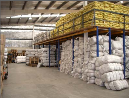
Blankets & Sleeping Mats at our warehouse in Dubai ready for airlift to Bandah Aceh, Sumatra.

At 14.20 hours on December 26 th 2004 the first call came through to AIPACS OAC to mobilize the first emergency airlift for Colombo, Sri Lanka. AIPACS OAC personnel worked 18 hour days for weeks on end moving thousand of tons of emergency goods to Sri Lanka, Indonesia and the Andeman & Nicobar Islands in the Indian Ocean. Plastic Sheeting, Tents, Kitchen Sets, Family Hygiene Kits, Water Carriers and Purification Equipment, Emergency Medical Supplies were airlifted from our facilities in Europe, Dubai, India & Pakistan to the affected areas on a daily basis.