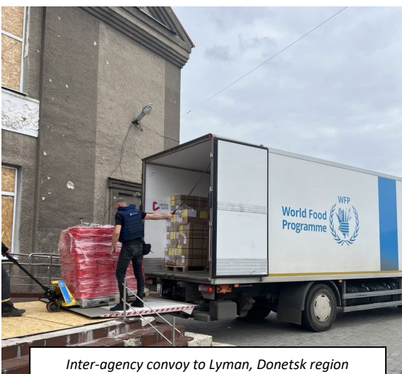
Inter-agency convoy to Lyman, Donetsk region