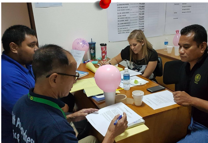
Logistics training, Palau.

Supported the rollout of the Pacific Community (SPC)-revised Emergency Operations Centre 4-day module to NDMO and partners in RMI (Majuro Atoll).