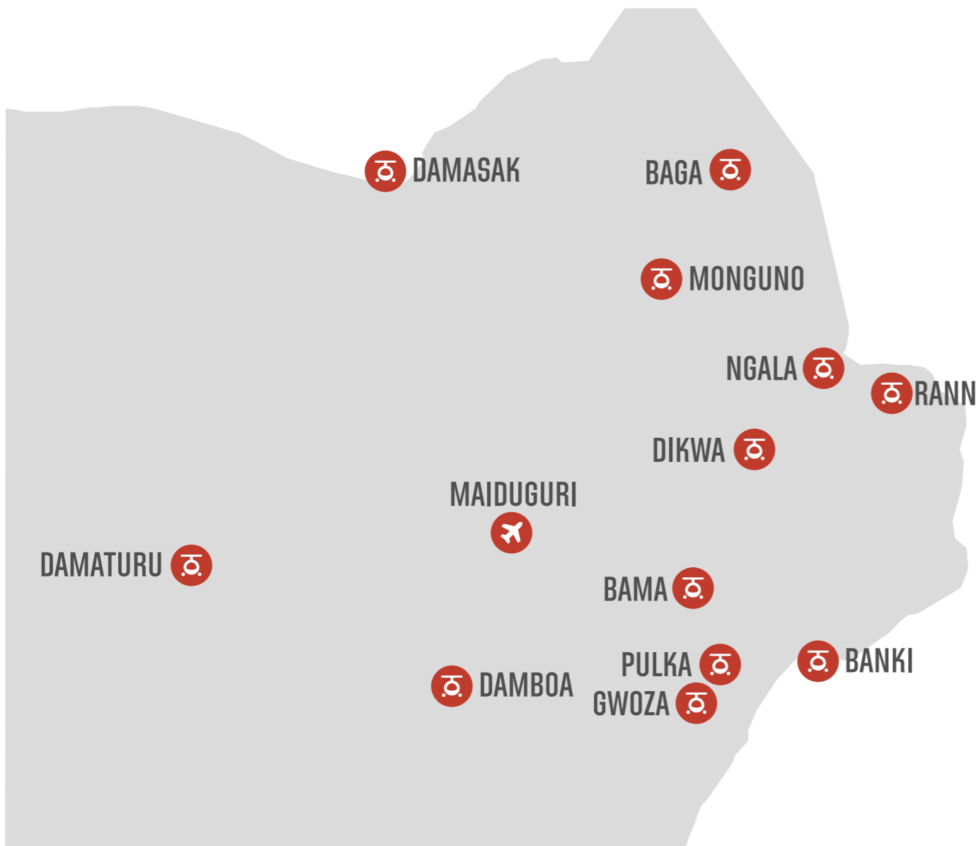
Locations served in north-eastern Nigeria

Despite the growing number of organisations using UNHAS helicopter services, operational efficiency has increased, with cargo handling and loading time being significantly reduced. User organisations have also benefitted in time saved, as they no longer need to arrange transportation of their cargo to the airport. To use the service, please follow these steps .