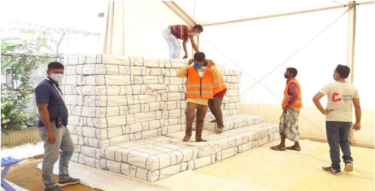
Receiving emergency preparedness materials including tarpaulin, canopies tent and jerry cans from IFRC