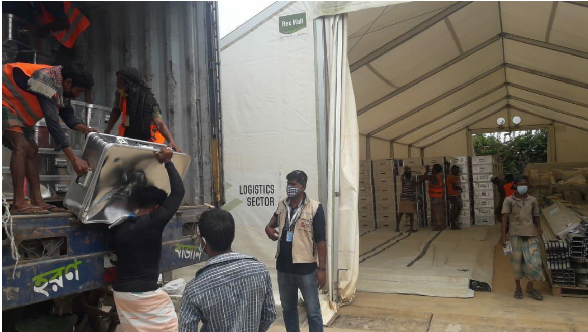
Receiving UNICEF's School in a box in Madhuchara Logistics Hub

distribution have been reduced to a bare minimum in line with current humanitarian priorities. To support effective decision making, the Logistics Sector provides technical logistics advice and access to facilities for organisations facing supply chain challenges.