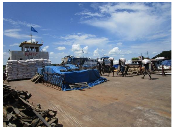
Barge Loading, Malakal, July 2019