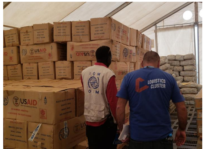
In Malakal, the Logistics Cluster manages 6,000 m 2 of common storage space for the humanitarian community.