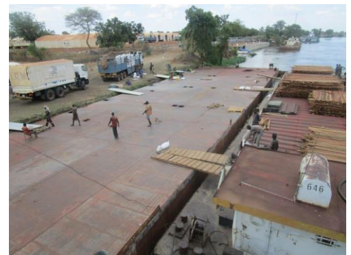
Barge Loading in Bor, April 2019