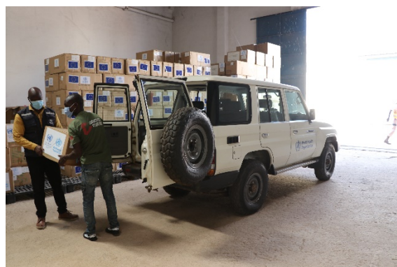
Dispatch of the PPE from the common pool at the Logistics Cluster common storage site in Juba.