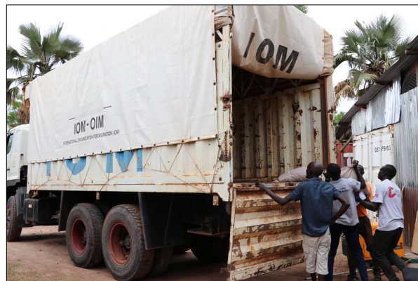
The Logistics Cluster Rumbek team loading partner's cargo for onward air transportation, July 2020.