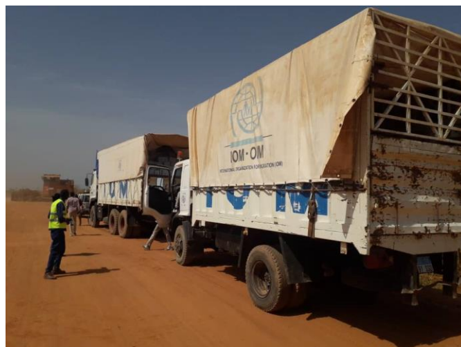
Beyond Bentiu Response departure, February 2020