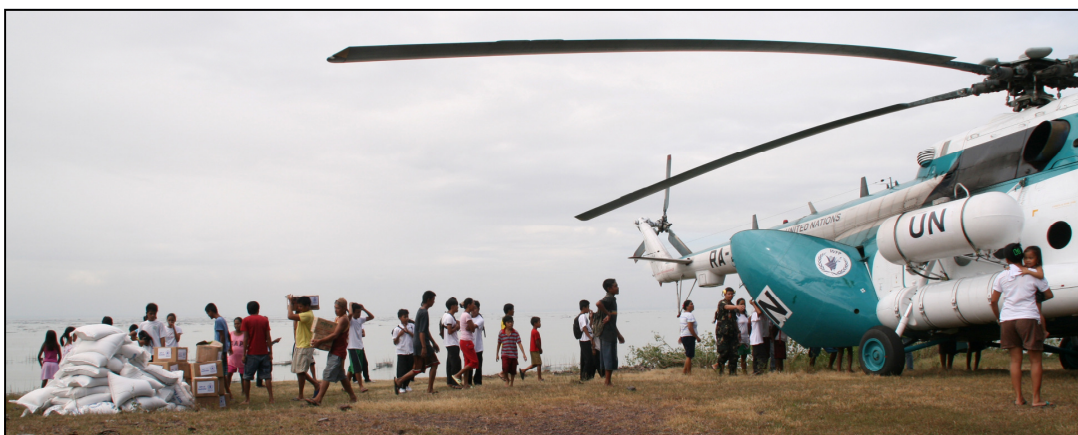
The Logistics Cluster unloads food for an orphanage in Subay, Rizal Province, which was severely damaged by Tropical Storm Ketsana ("Ondoy").

The Logistics Cluster will no longer have a dedicated GIS officer in Manila however all Logistics Cluster maps will continue to be available up to A0 size through the WFP office in Manila. As always, maps can also be downloaded from the Logistics Cluster website at www.logcluster.org/phl09a .