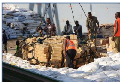
Loading of participants' cargo on a Logistics Cluster coordinated vessel at Mombasa Port

The Logistics Cluster provides free-to-user sea transport for relief cargo on chartered ships from Mombasa to Mogadishu. Transport to Berbera/Bossaso,