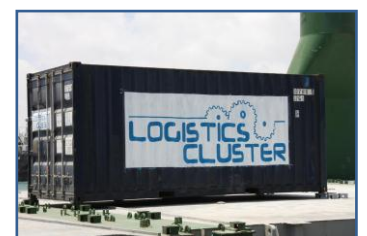
Container with the 5 MSUs on the vessel in Mogadishu

5 Mobile Storage Units (MSUs), 10 m X 32 m each, are currently available in Mogadishu free of charge and on a lease basis to the humanitarian community in Somalia. Organisations leasing the MSUs from the Logistics Cluster will be responsible for transporting the MSUs to their final destinations, and installing and managing the units themselves.